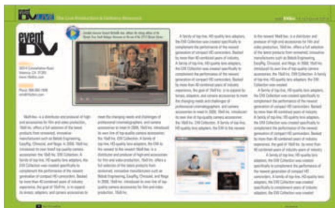
Sample Listing full page