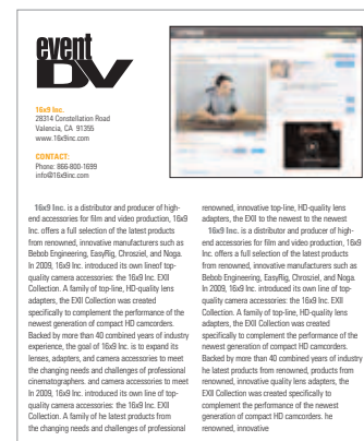
Sample Listing 1/2 page